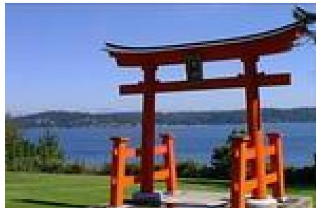
Torii Gate Campbell River's Sister City Symbol [Ishikari, Japan]